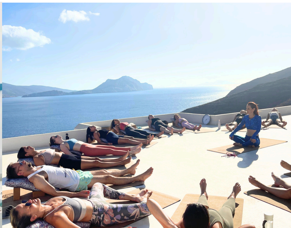
DIFFERENT YOGA SESSIONS (HATHA/VINYASA IN THE MORNING, YIN/ RESTORATIVE IN THE EVENING), MEDITATION, PRANAYAMA. BREATHWORK