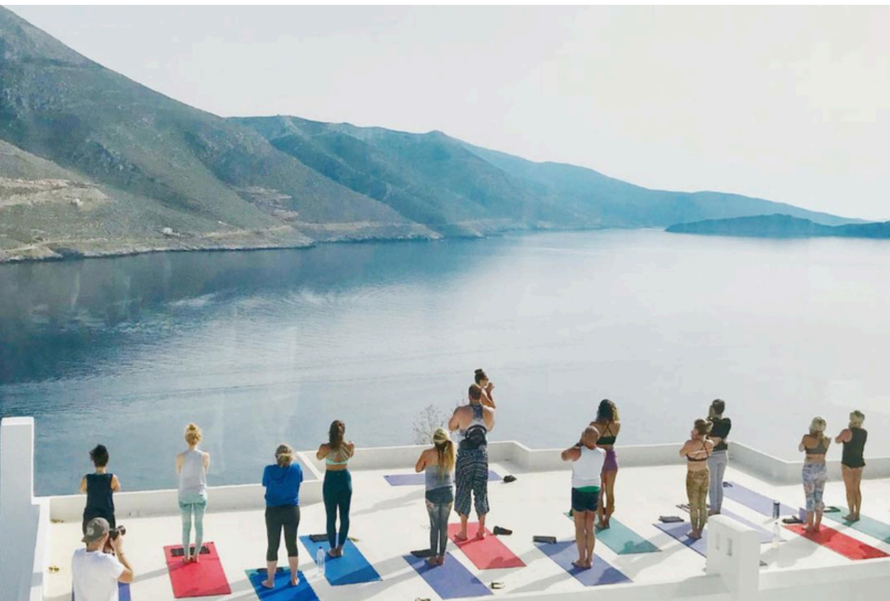
SOUND BATH AND SOUND MEDITATION SESSIONS WITH ANCIENT HIMALAYAN BOWLS AND OTHER INSTRUMENTS FROM INDIA, BALI AND NEPAL