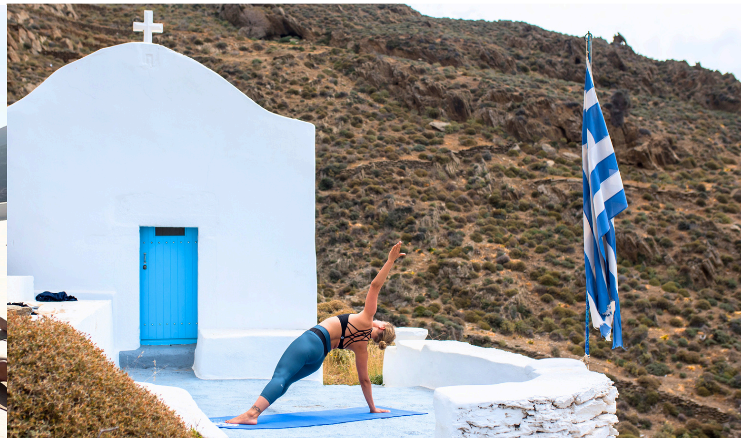
AND WE WILL INDULGE IN MOST DELICIOUS ORGANIC FOOD FROM FARMERS AND GARDENS.